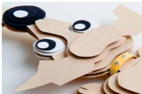
Recycled paper dogs made for the K.W.Doggett Student Calendar 2010.