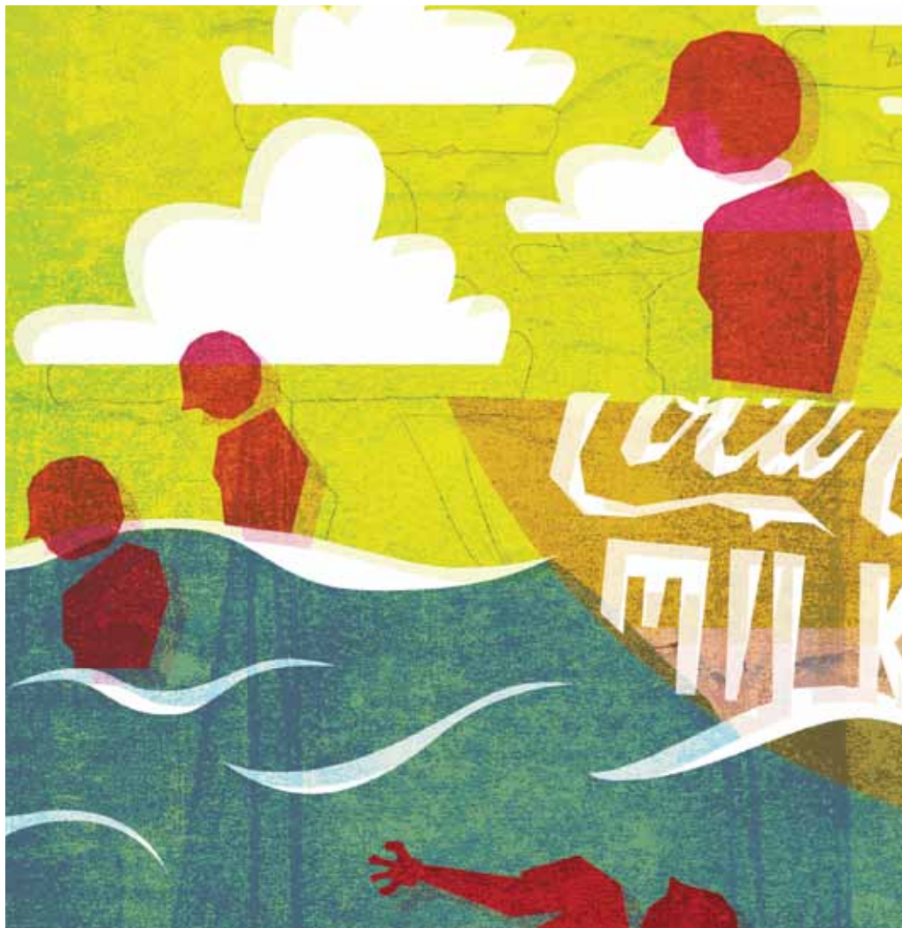
A multimedia illustration designed for the 4th January 2011 edition of The Big Issue.